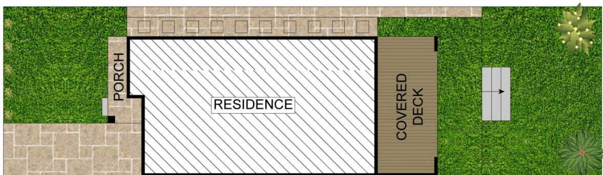
SITE PLAN ( NOT TO SCALE )